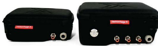
Product Code: HX0001 Product Code: HX0003

Portable and easy to use, HEMORRHAGE-X is available in two different models: HEMORRHAGE-X1 , with one output; and HEMORRHAGE-X3 , with three outputs.